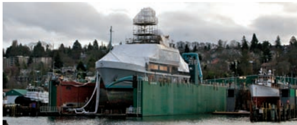
The Alucia , center, dwarfs the Stacey Foss , left, and the yacht Thea Foss .

Air France Flight 447 plunged into the South Atlantic in June 2009, killing all 228 people on board. The Alucia's effort to find the plane, financed by Air France and Airbus, was the fourth attempt to find the jetliner.