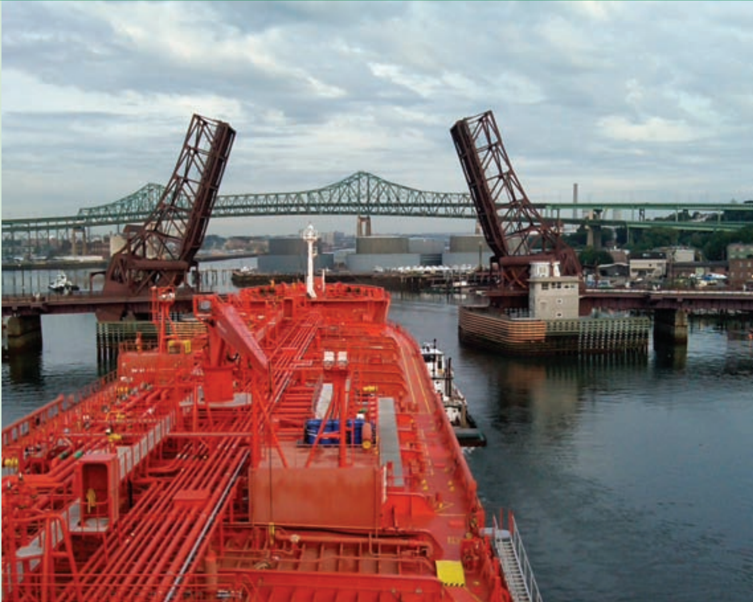
After the passage through the Chelsea Street Bridge, the channel through the Andrew P. McArdle Bridge looks like a wide one.

The Andrew P. McArdle Bridge is the first obstacle one encounters upon entering the creek. It is a bascule bridge that opens on demand with a horizontal clearance of 175 feet. The biggest ships that transit are no larger than 106 foot beam and 800 feet in length, but with a tug traditionally tied alongside the port bow to control the ship, the clearance during passage can be as little as 20 feet on either side.