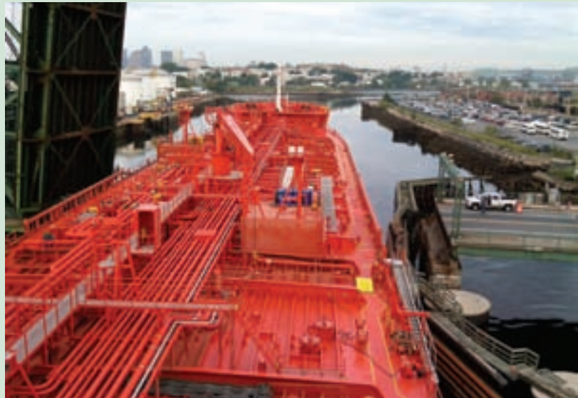
The outbound " Boston Beam " tanker squeezes its way through the Chelsea Street Bridge.