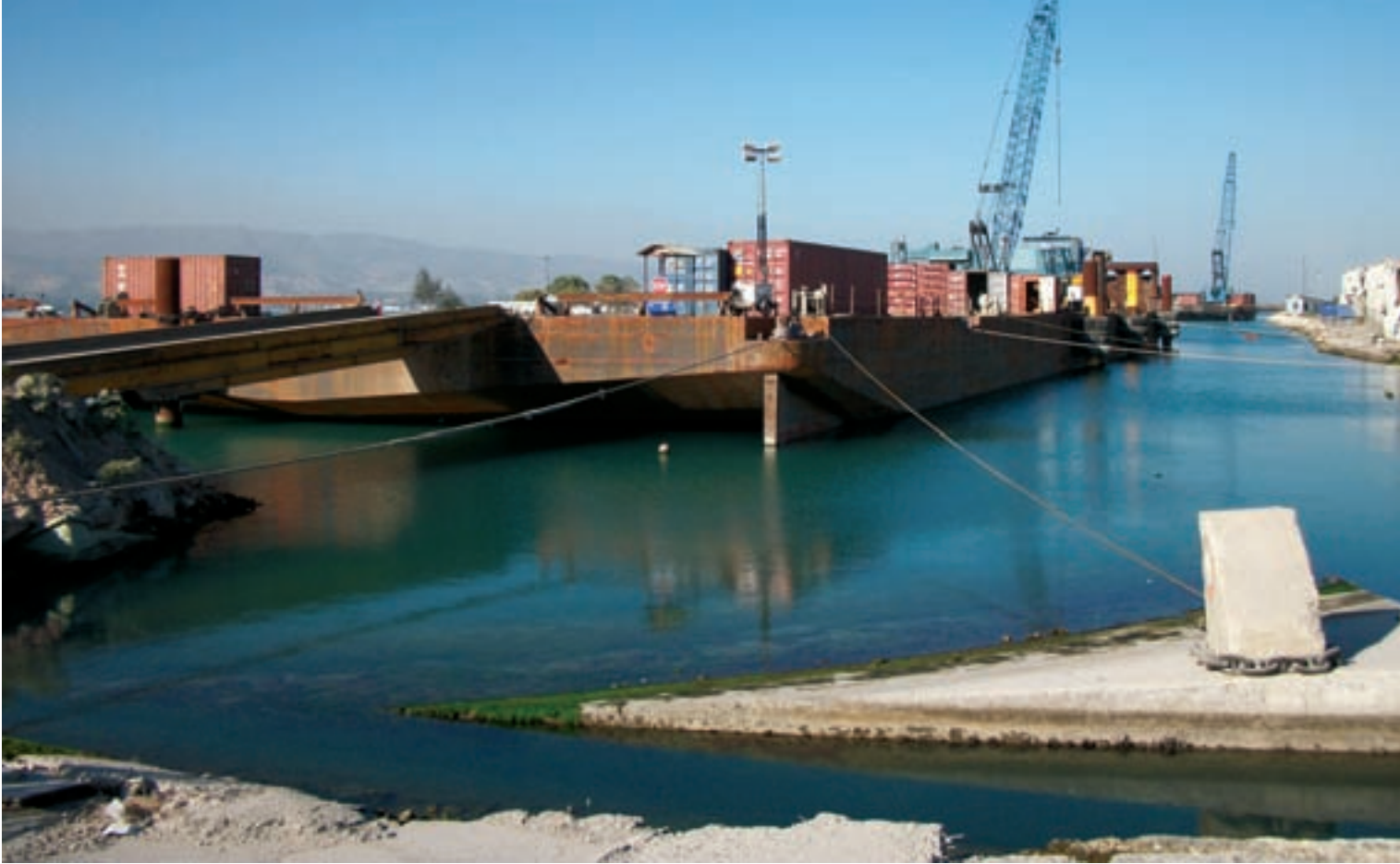
The barges Heavy Lifter , foreground, and Columbia Boston on station in Port-au-Prince, Haiti.