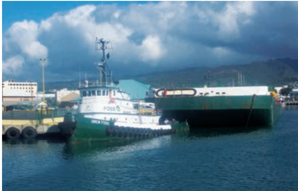
The Drew Foss departed Honolulu for Kwajalein Island in January.

From there, the tug and barge headed to Singapore (4,000 miles) to pick up cargo for shoreline