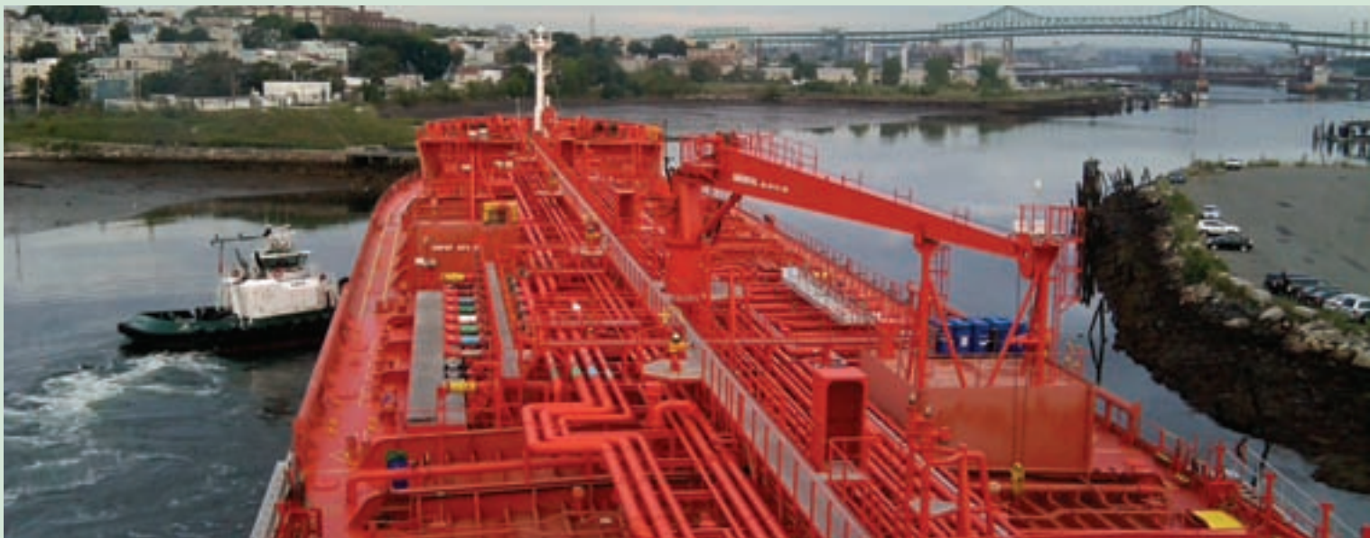
The tractor tug Leo helps the tanker around Cabot's Corner.