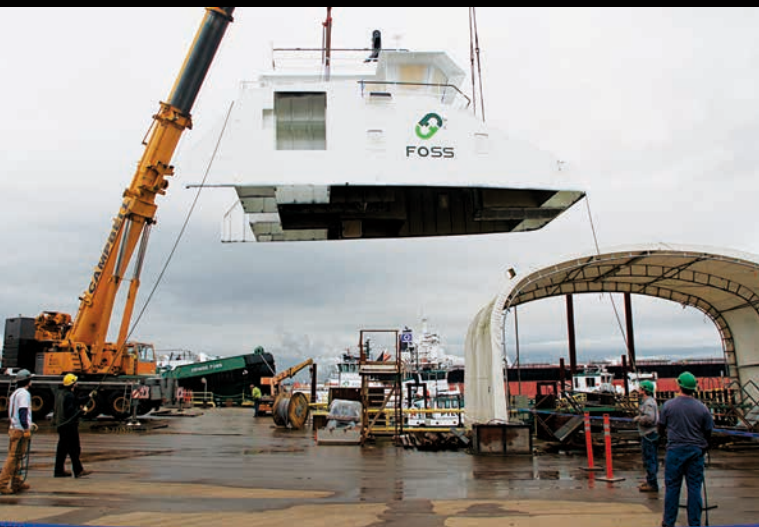
▲ Above: The Denise Foss is in the background as the house is lifted high above the tarmac on the way to its destination.