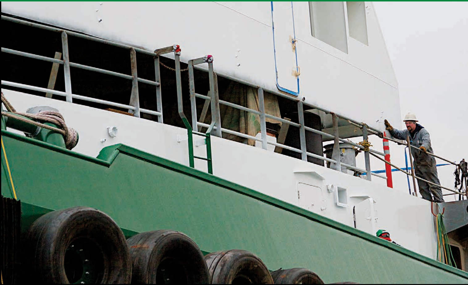
▲ Above: Cook eyeballs the aft end of the house as it is lowered into place.