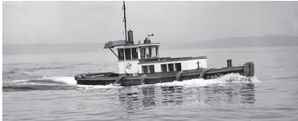
Above, the Foss No. 12 , underway on a calm, Puget Sound day, and below, spraying water with all five nozzles.

Andrew installed five fire nozzles with the primary nozzle used for small fires. All five could be operated for major fires. The primary nozzle could throw a stream of water 115 feet which