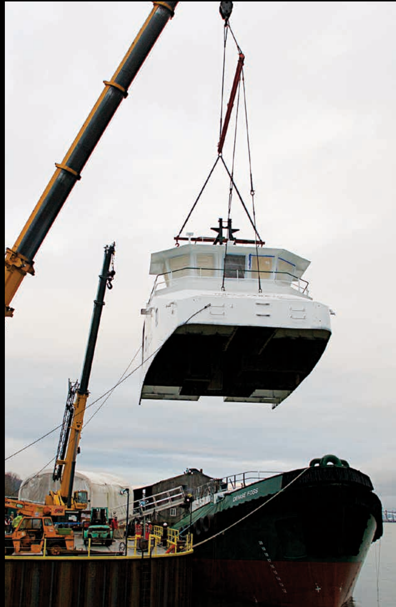
▲ Above: The house nears its destination.