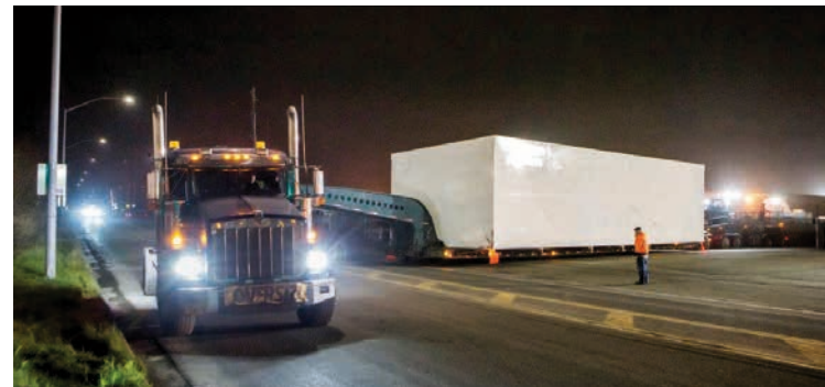
Maneuvering loads of this magnitude through city streets — the gross weight of the ConocoPhillips module was 425,000 pounds — is a challenge that requires use of the Carlile Load King.

loads. The project, which began in late December and runs through April 2016, will establish a new base camp for CH2M.