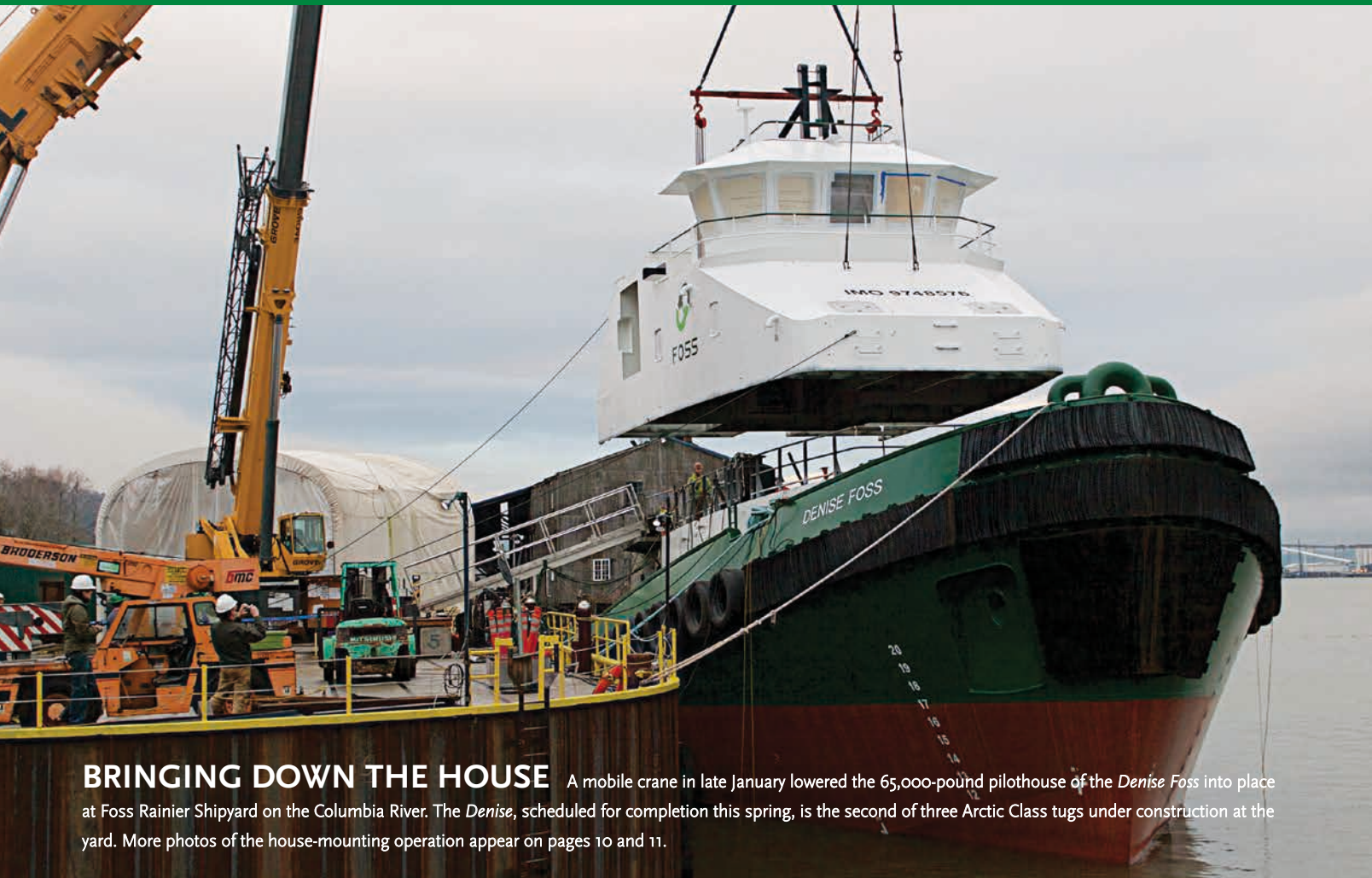
BRINGING DOWN THE HOUSE A mobile crane in late January lowered the 65,000-pound pilothouse of the Denise Foss into place at Foss Rainier Shipyard on the Columbia River. The Denise , scheduled for completion this spring, is the second of three Arctic Class tugs under construction at the yard. More photos of the house-mounting operation appear on pages 10 and 11.