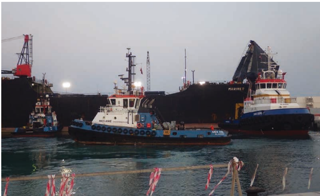
In the photo above, local tugs assisted the Mariner , the barge section of the Strong Mariner , as cargo was offloaded at one of the man-made islands off the coast of Abu Dhabi. Below, cargo was unloaded from the barge on one of the MAFI trailers that carried the rig modules all the way from China.

“A unique advantage of our service was that most of the cargo was already on the MAFI trailers, and it could be driven off the vessel and to the