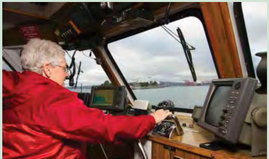
Gina McCarthy of the EPA at the helm of the Caribe Horizon

Since 2005, the Ports of Long Beach and Los Angeles have cut