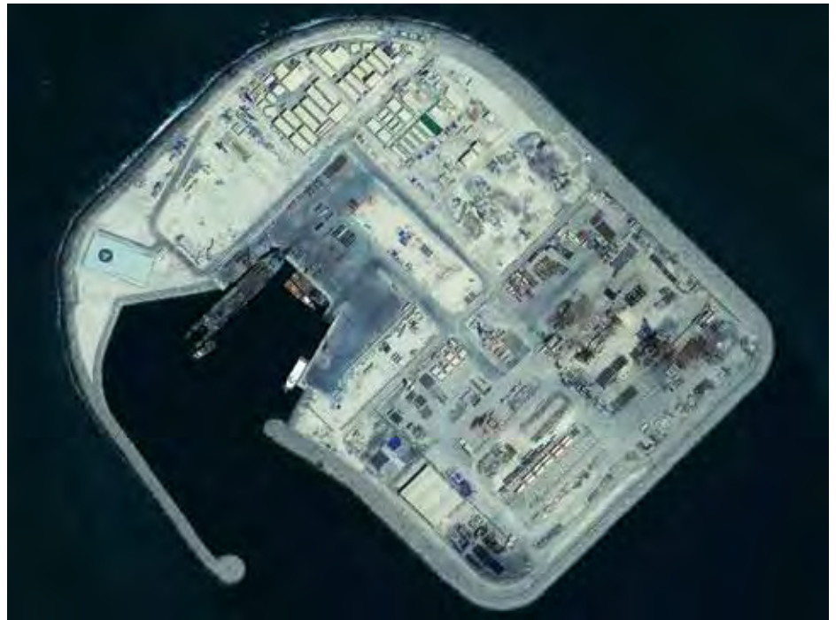
Aerial photos shows barge Mariner in its berth at South Island.