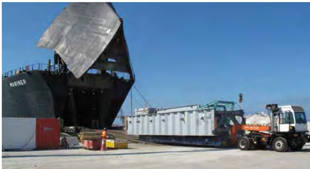
Cargo comes off the Mariner through its clamshell bow.

Foss crews worked through the Christmas holidays in delightful 80 degree Fahrenheit weather to