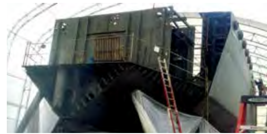
The first of three Arctic Class tugs takes shape at Foss Rainier Shipyard. Delivery is scheduled for late this year. The vessels will be 132 feet long and will have ice strengthened hulls.

Some of the employees Foss will add to support its work in the Arctic may be native Iñupiat, whose corporation is the Arctic Slope Regional Corporation (ASRC). ASRC owns nearly 5 million acres on the