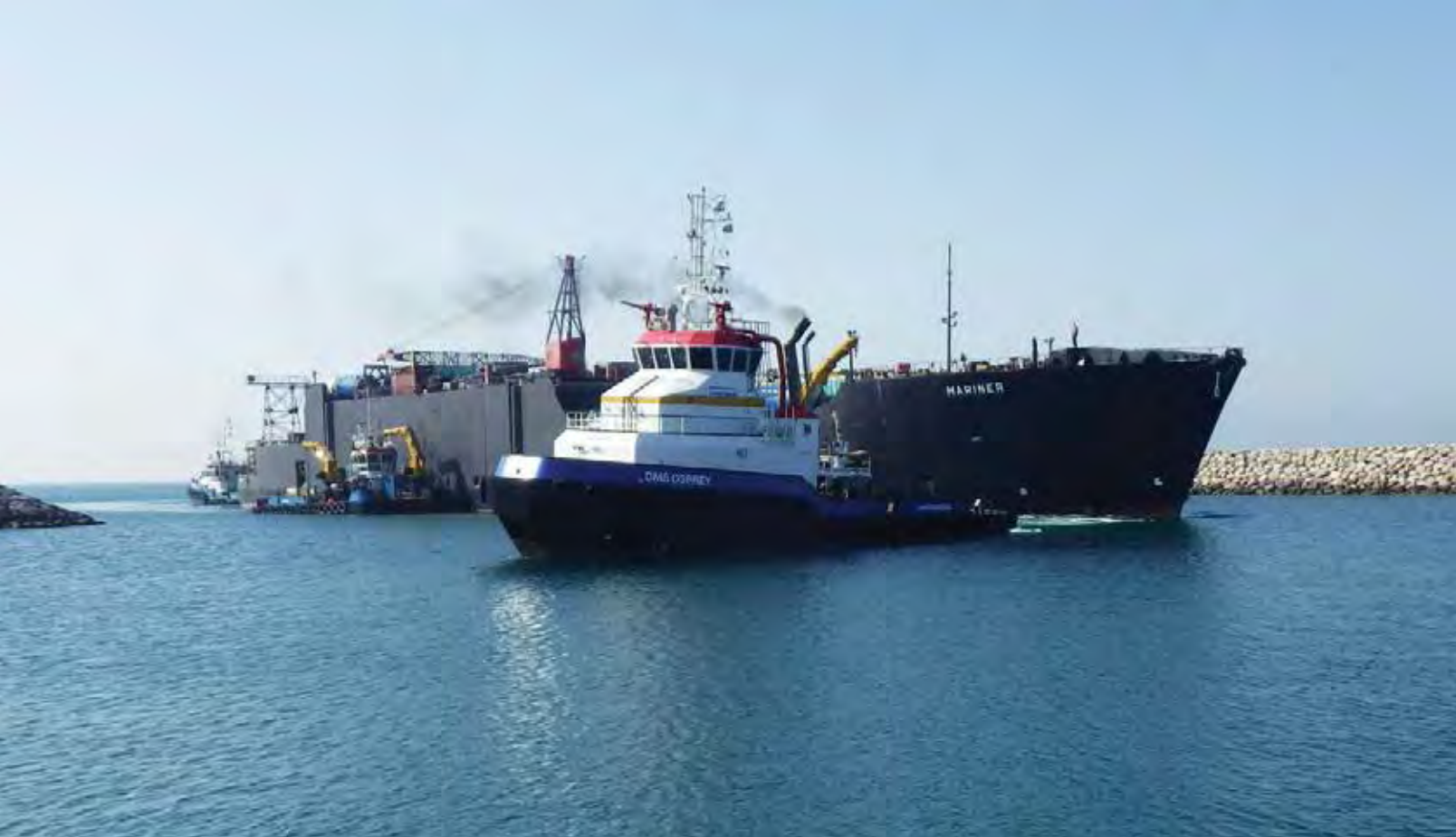
Local tugs brought the Mariner into the harbor.

manner with good planning and management.