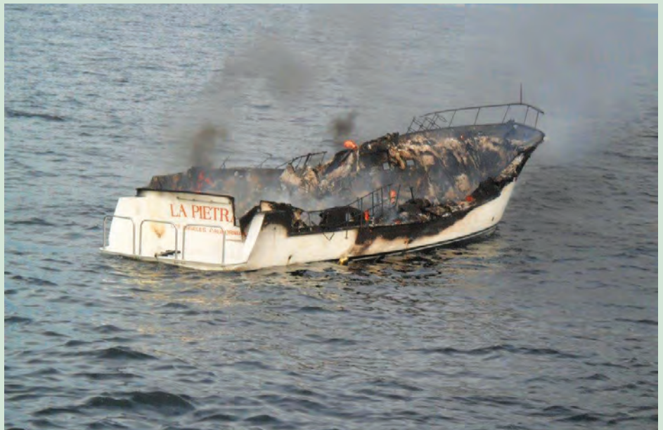
The motor yacht La Pietra had burned almost to the waterline when the Jeffrey Foss arrived at the scene.