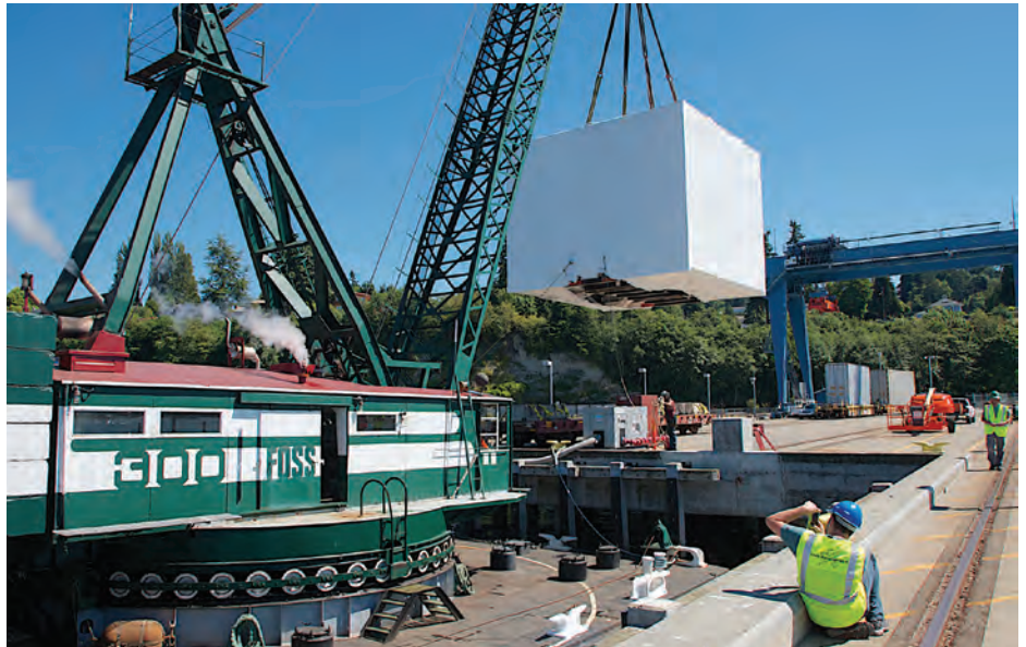
The Foss 300 derrick lifted the bulky package holding the riveting machine from a rail car before moving it to the barge 185 C-3, which was waiting a few hundred yards offshore.