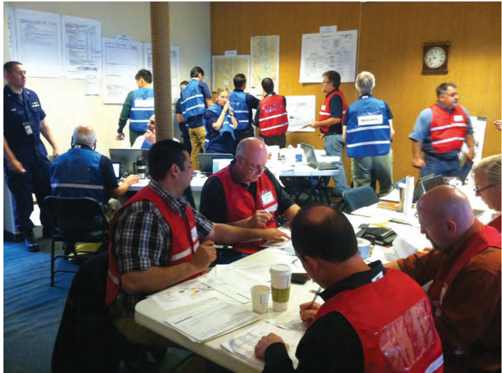
The command center was abuzz with activity during the Portland drill, which had 50 participants.

She added, "We make sure to develop and implement lessons learned after every drill so we can continually improve."