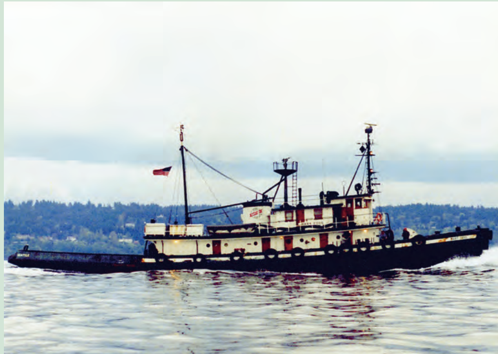
The Miki-class tug Mary Foss , the seventh of nine purchased by Foss after World War II, entered service for Foss in 1957 towing railcar barges on Puget Sound. The Mary and its sister ships were engaged in ocean towing on the West Coast and Alaska for most of their careers.

1960s with a continued buildup of Pacific Northwest Harbor Services and regional towing as well as ocean work. During this decade, 41 tugs, no less than 23 of them newly built boats, entered Foss service. With the retirement of 27 tugs, Foss had a net gain of 14 tugs during the decade.