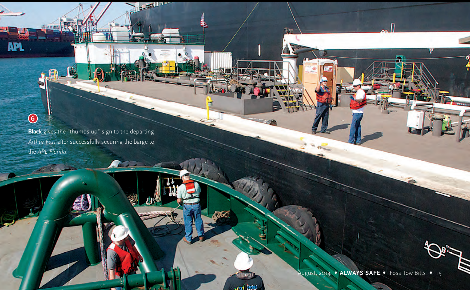
6 Black gives the “thumbs up” sign to the departing Arthur Foss after successfully securing the barge to the APL Florida .