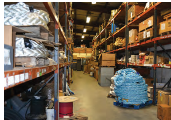
In this pre-reorganization photo, the shelving of the Seattle warehouse was jammed and the aisles were cluttered.