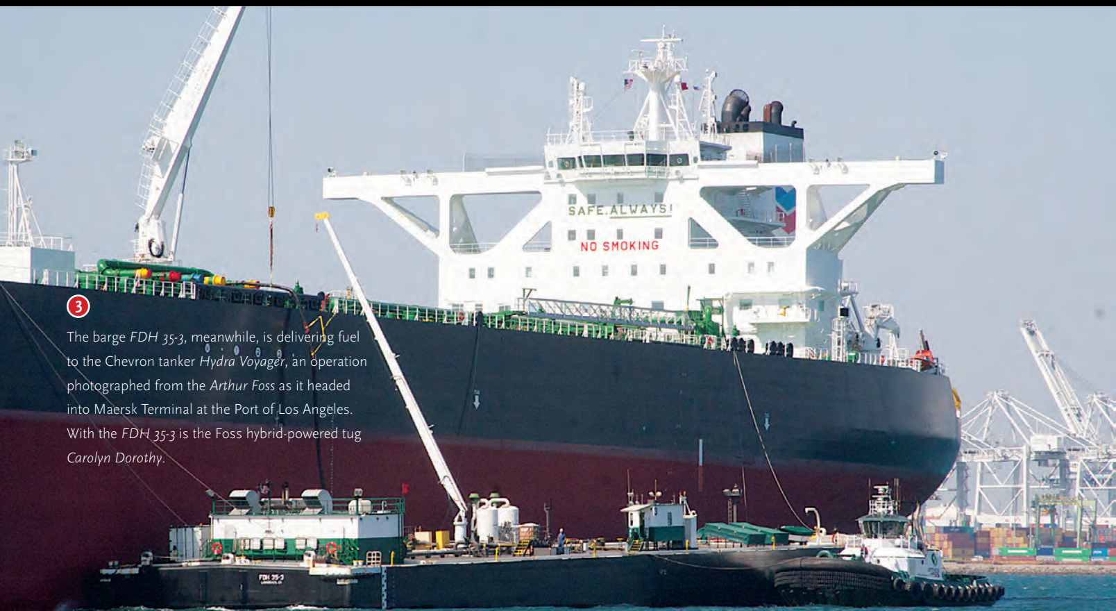
3 The barge FDH 35-3 , meanwhile, is delivering fuel to the Chevron tanker Hydra Voyager , an operation photographed from the Arthur Foss as it headed into Maersk Terminal at the Port of Los Angeles. With the FDH 35-3 is the Foss hybrid-powered tug Carolyn Dorothy .