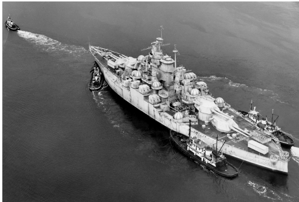
Four Foss tugs moved the battleship West Virginia through Rich Passage near Bremerton in 1959. They were the Shannon Foss , towing, Carol Foss , port side forward, Agnes Foss , port quarter, and Patricia Foss , starboard quarter.

Foss tugs also were involved in the towing of the West Virginia 's sister ships, the Colorado (BB 45) and the Maryland (BB 46), also in 1959. The tow of the Colorado was a repeat of the tow of the West Virginia , from Bremerton to Todd Shipyard Seattle. However the tow of the Maryland was a bit more time consuming, as Foss was directed to tow the Maryland from Bremerton to Oakland, California, a distance of 850 miles. Foss called on two of their 1500-horsepower